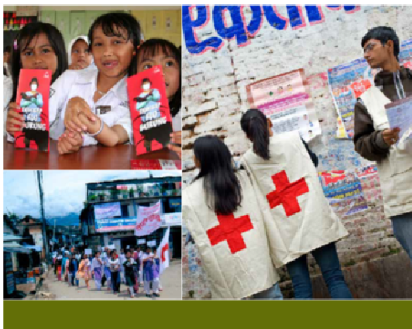
Public awareness and public education for disaster risk reduction: a guide

www.ifrc.org Saving lives, changing minds.