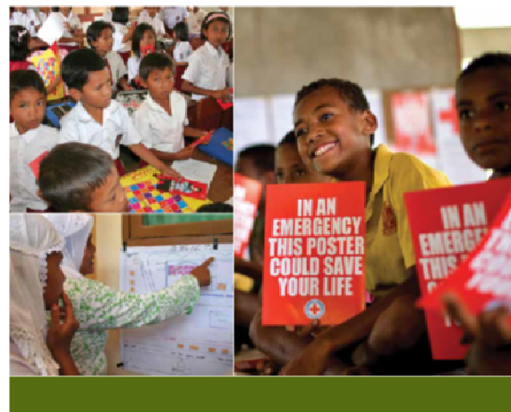
Public awareness and public education for disaster risk reduction: key messages

www.ifrc.org Saving lives, changing minds.